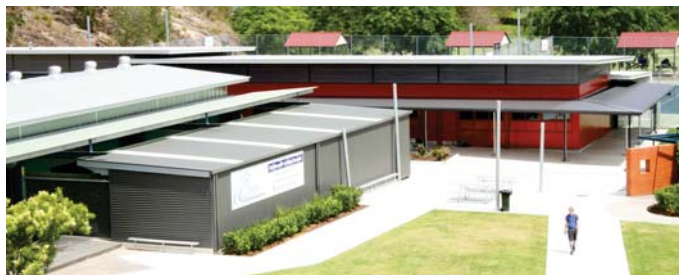
St Edmund's College State of the Art Trade Training Centre