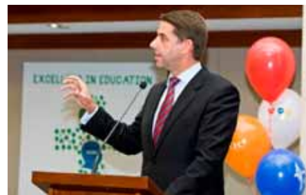
The Hon Cameron Dick MP, Minister for Education and Industrial Relations